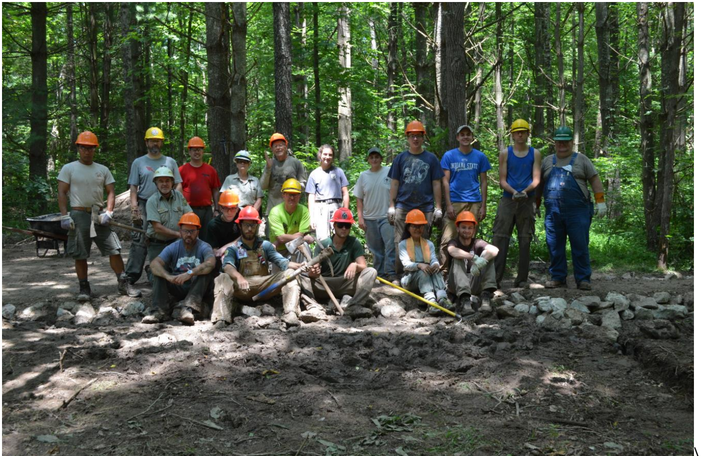
The NOAC Work Crews With KHTA Volunteers & HNF Supervisors